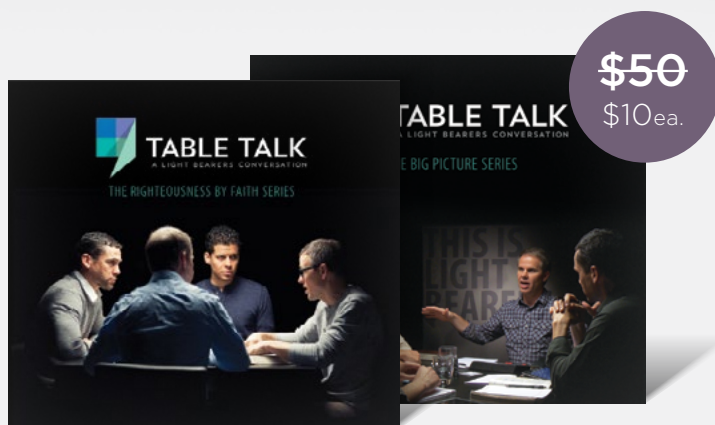
TABLE TALK SEASONS 1 & 2