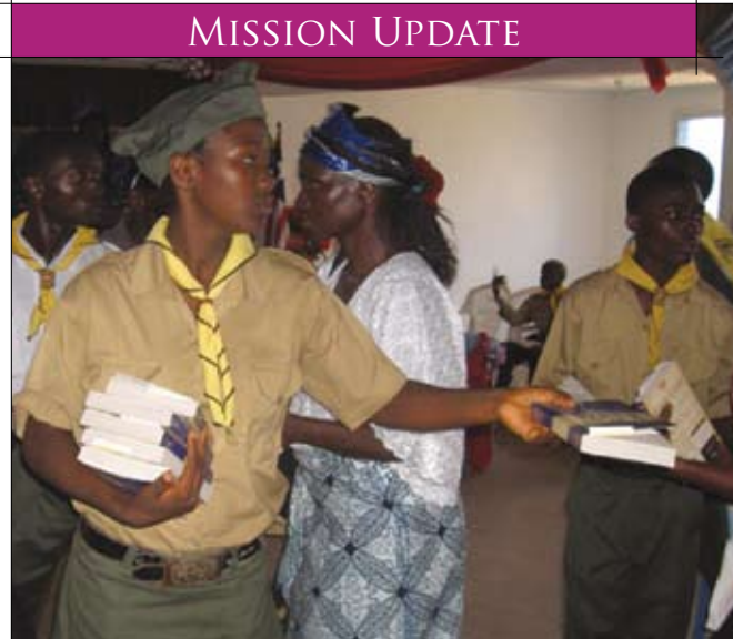
Pathfinders handing out Bibles in Liberia