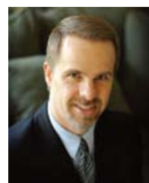
By Ty Gibson

Greetings from Thailand! What an amazing place and what a lovely people!